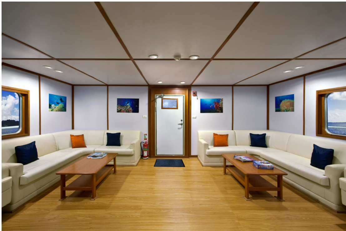
The Indoor lounge on the Infiniti

The Infiniti is a 39m superyacht with four decks, and multiple relaxation areas including an indoor lounge, an outdoor lounge, a dining room & a huge sundeck. 12 guests are accommodated in six spacious & nicely furnished guest rooms on the main deck & upper deck. The Infiniti has a highly qualified onboard crew (captain & other ship crew, hospitality team including a dedicated chef & dive team of PADI divemasters & instructors). The Infiniti was custom designed & built in Thailand in 2013 under complete supervision of RINA 2 & is certified for unrestricted navigation in the open sea and also IRS 3 certified for Indian registration and operation in all waters of India. It is a PADI dive boat and is authorized to teach diving & issue PADI certifications.