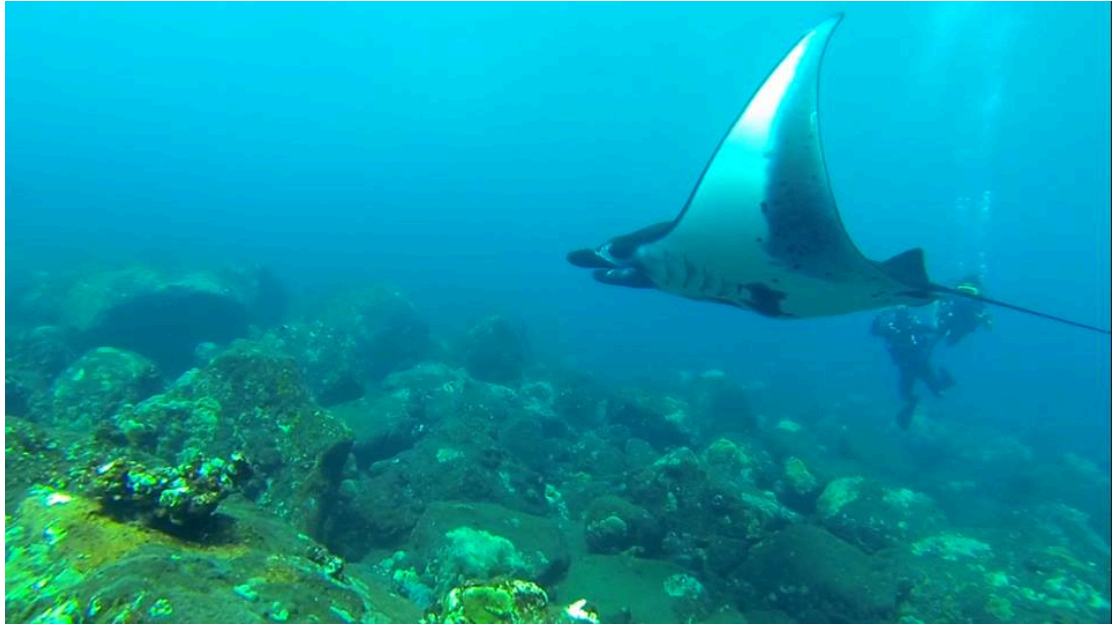
A Manta Ray glides by gracefully underwater at Barren Island