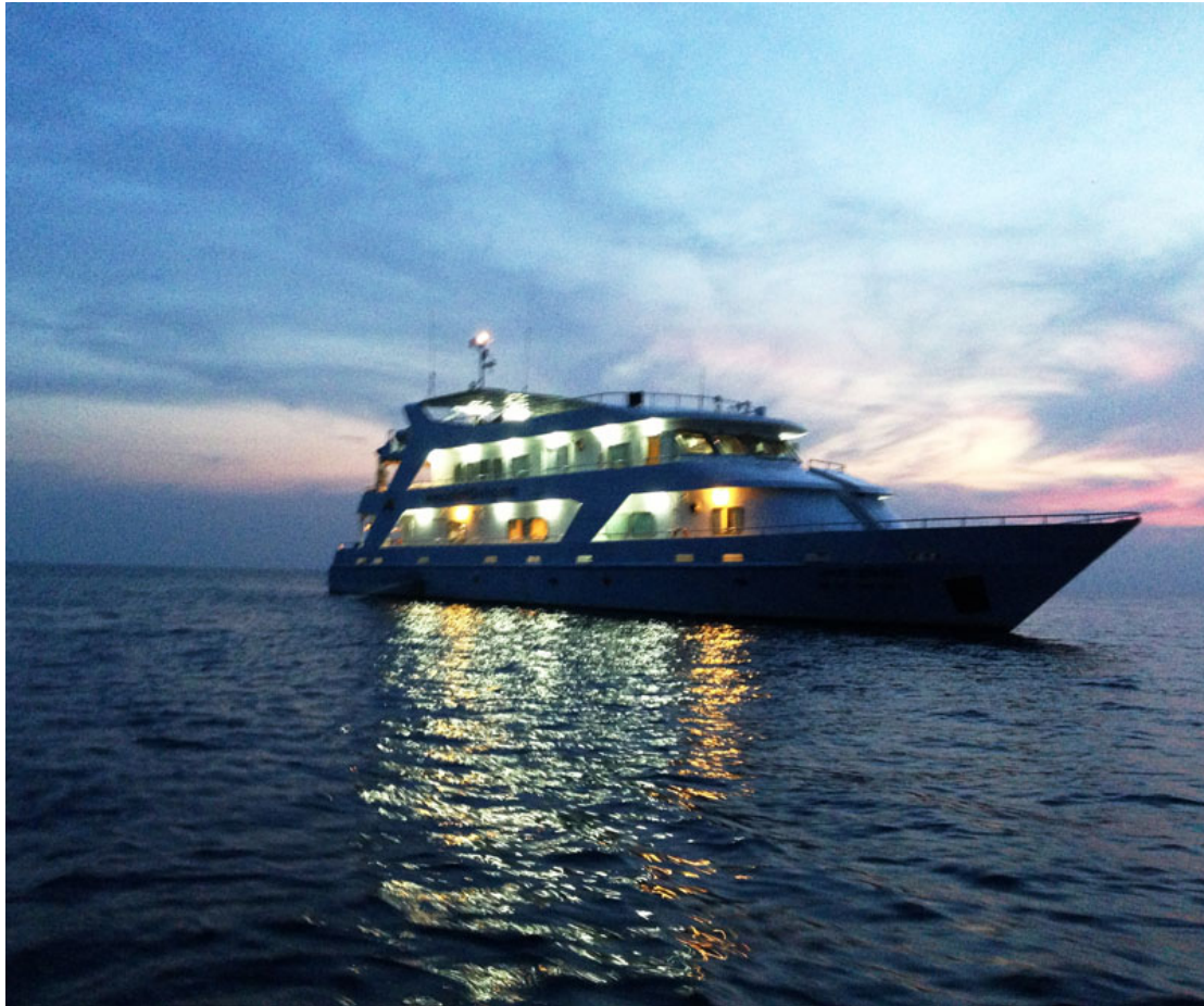
The beautiful live-aboard (superyacht) Infiniti

A diving package for a 5-night live-aboard trip to Barren Island on the Infiniti is priced at $1,899 or Rs 1,09,000 + tax and includes: